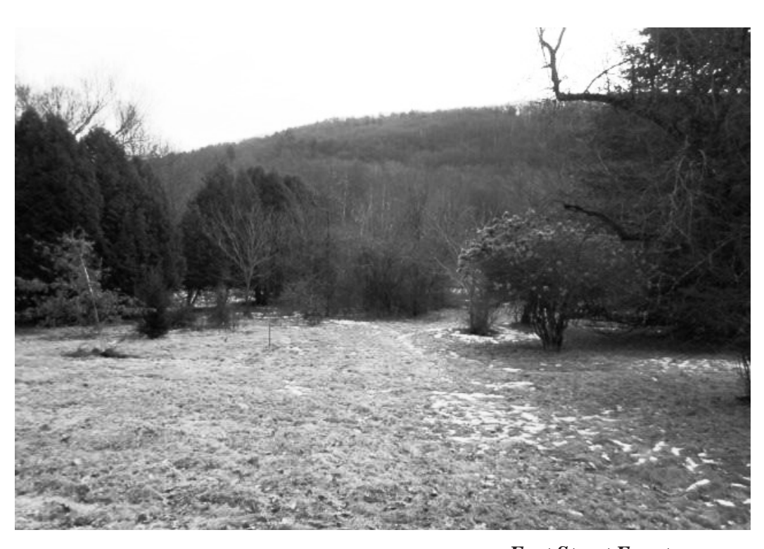
East Street Frontage

The City's tract was bought with $380,000 in Easthampton CPA dollars -- thank you, taxpayers, City Council, and Mayor! -- and a $400,000 state grant. And lest we forget, this acquisition was jump-started with a critical early investment of $50,000 from Pascommuck.